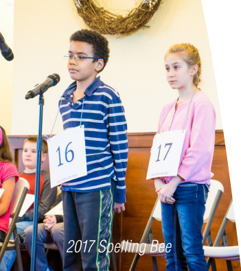
2017 Spelling Bee