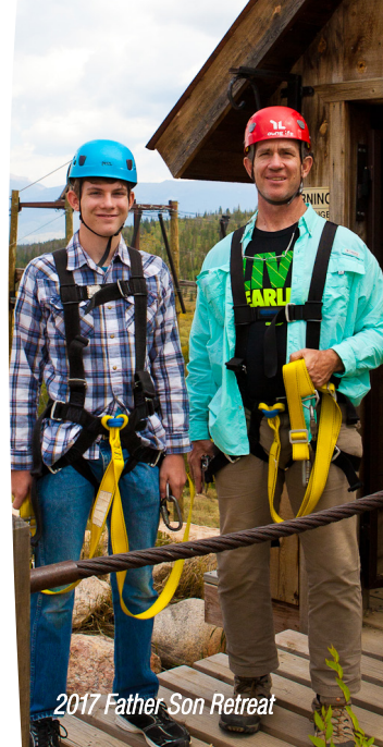
2017 Father Son Retreat